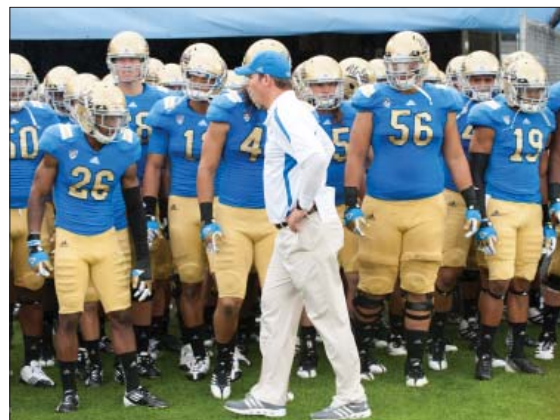
The 2012 Bruins