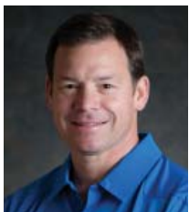
JIM MORA Head Coach 2nd Season Washington '84

On December 10, 2011, former Atlanta Falcons and Seattle Seahawks head coach Jim Mora was named UCLA's 17th head coach in school history. In his first year as head coach, Mora guided the Bruins to the 2012 South Division Championship of the Pac-12 Conference and matched the school-record for wins by a first-year coach, with nine. The Bruins, who played in the Holiday Bowl, set numerous offensive records during the course of the season, including establishing a new school rushing leader, in Johnathan Franklin, and several passing marks achieved by Brett Hundley. On defense, Anthony Barr emerged as one of the most dynamic performers in the country in his first season as a linebacker and led the nation in sacks for a good portion of the season.